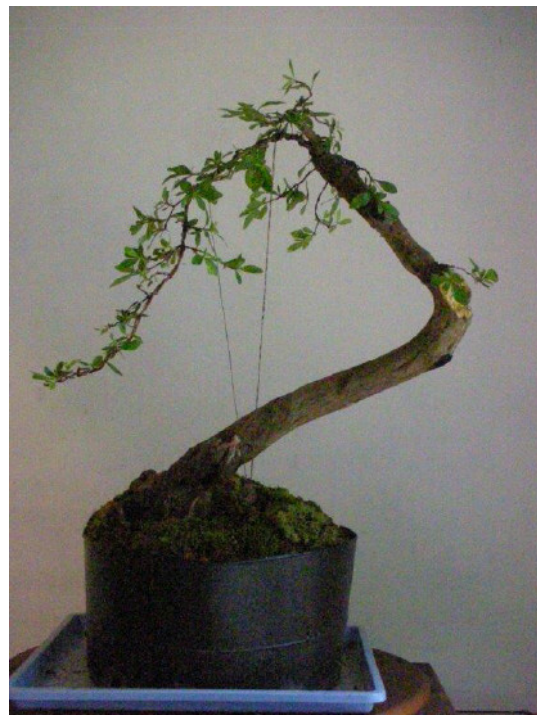
It's on its way with a good start.