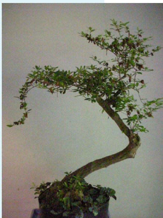
The start with an odd creature

Here is the azalea I worked on today. I collected it from a friend's yard about 7 years ago, and planted it in my yard. Last September I dug it up and cut the roots and planted it in this cut-off nursery pot – which is 14 inches in diameter and 7 inches deep. It has grown profusely since last September, and today I trimmed and gave it its first wiring. The pruning appears drastic – but it will grow out quite a bit – at least it now has a better skeleton on which to develop new foliage. Azaleas bloom on new growth, so it should have a lot of blossoms next Spring. In late Winter I shall place it in a bonsai container – one that is only about 3 1/2 inches deep. So, I do not want to disturb the root system now so the tree can continue its active growth ... will send more photos when it is repotted, and when it blooms.... The tree has a very large base – it is about 40 – 50 yrs old.